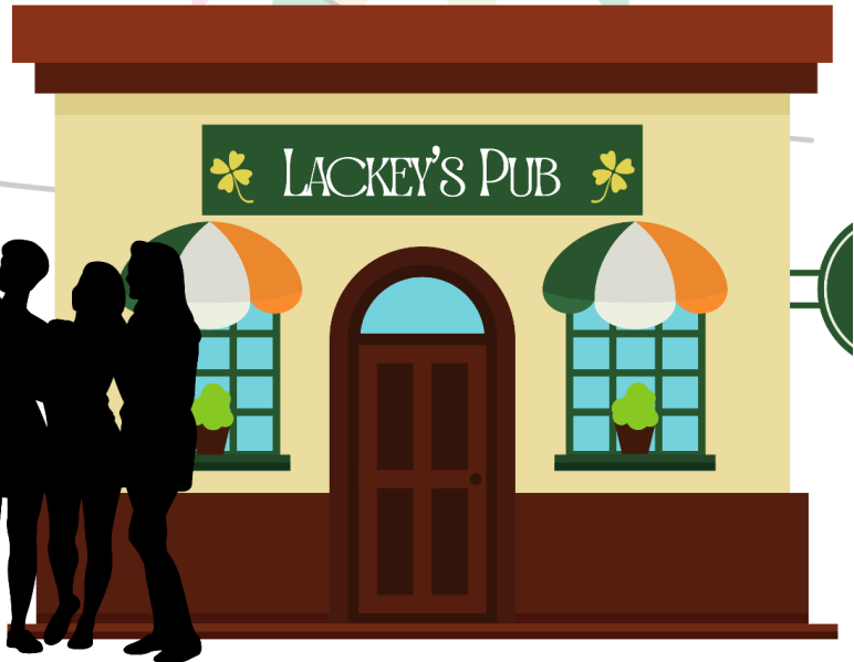
$1,500 8' x 12' Vinyl-printed Personalized Storefront based on your actual or Imagined business