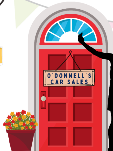
$600 8' x 4' Door of Dublin w/ Personalized Sign